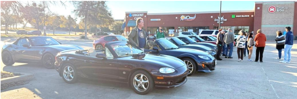
Left: Staging at Albertson's