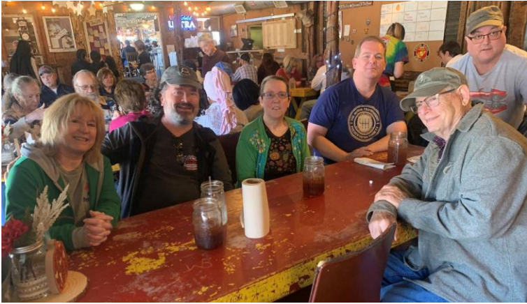
Indide Loco Coyote: