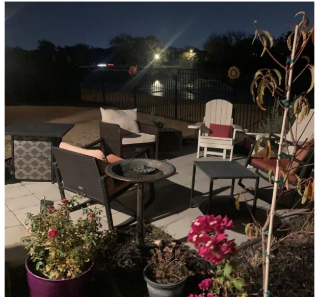
Sarah's back yard