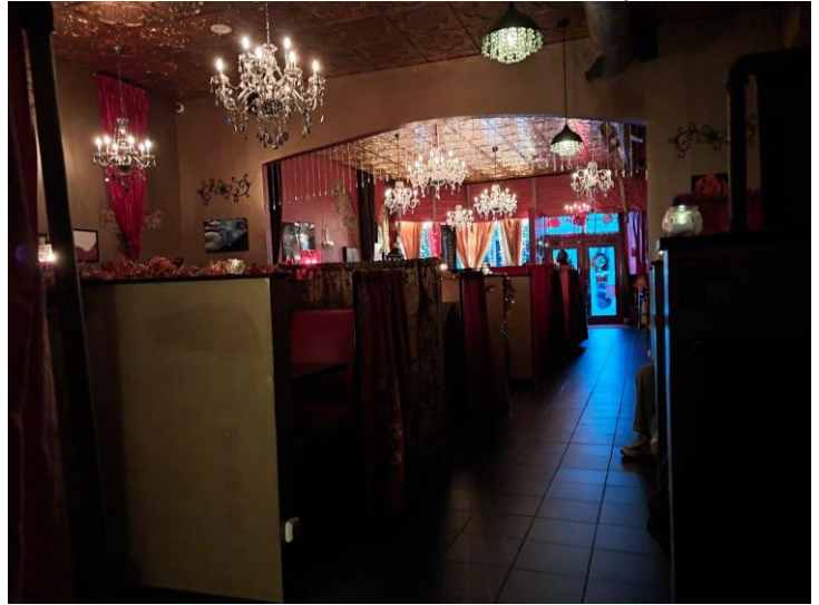
At Better Than Sex, the atmosphere is dark