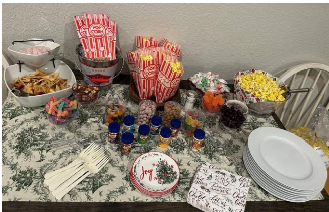
Have to have popcorn