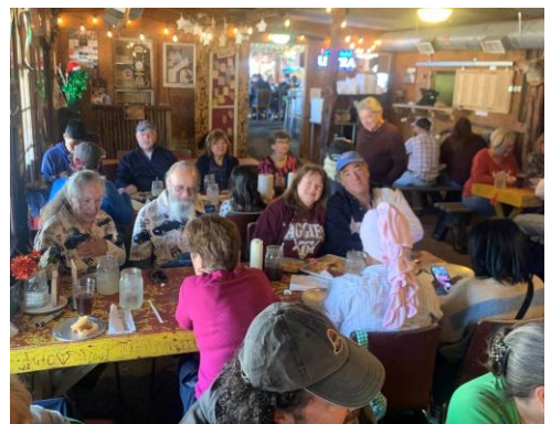
Had a good group at Loco Coyote