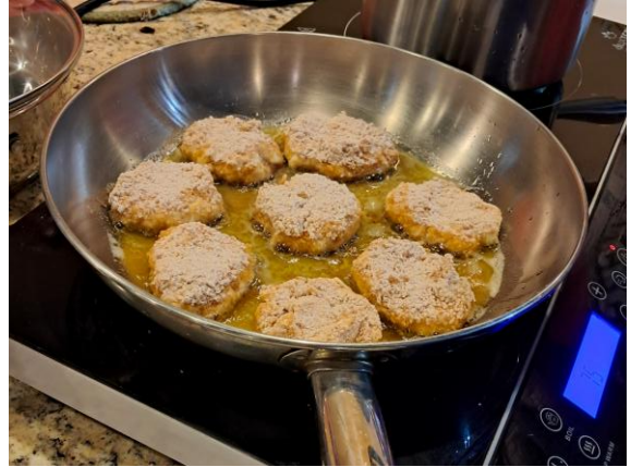
Fried Goat Cheese with Grapefruit & Honey Reduction