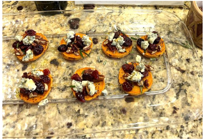
Sweet Potato Crostinis