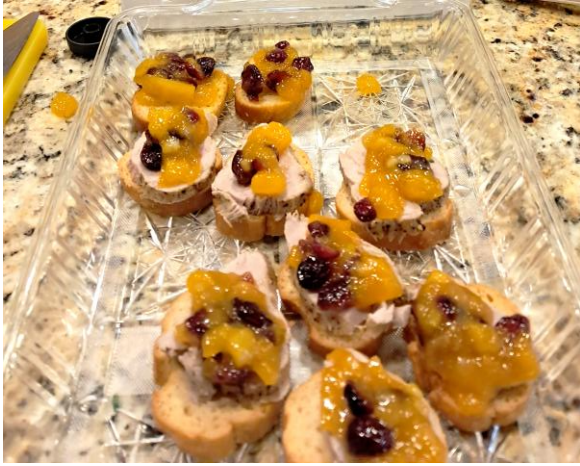
Cranberry Pear Mango Chutney