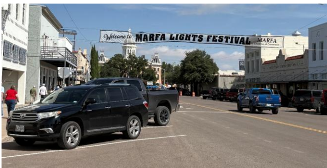
Marfa Lights Festival