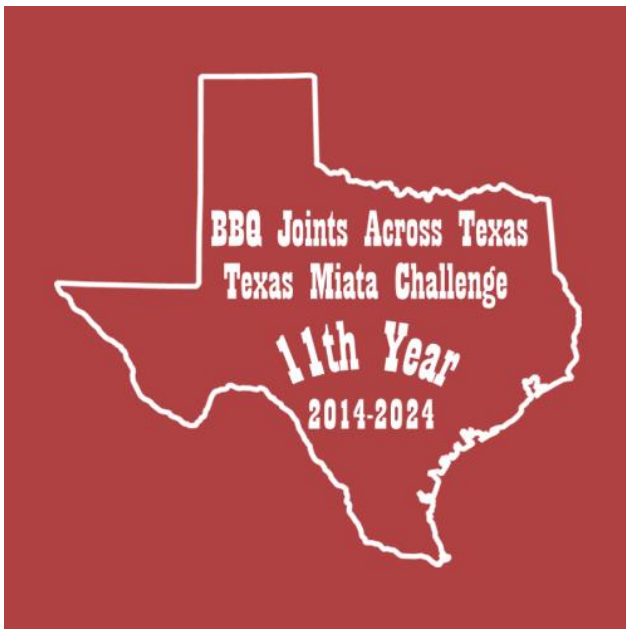
LEFT: Front of shirt detail.