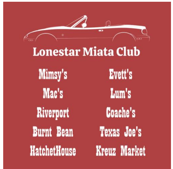
ABOVE: Back of shirt.