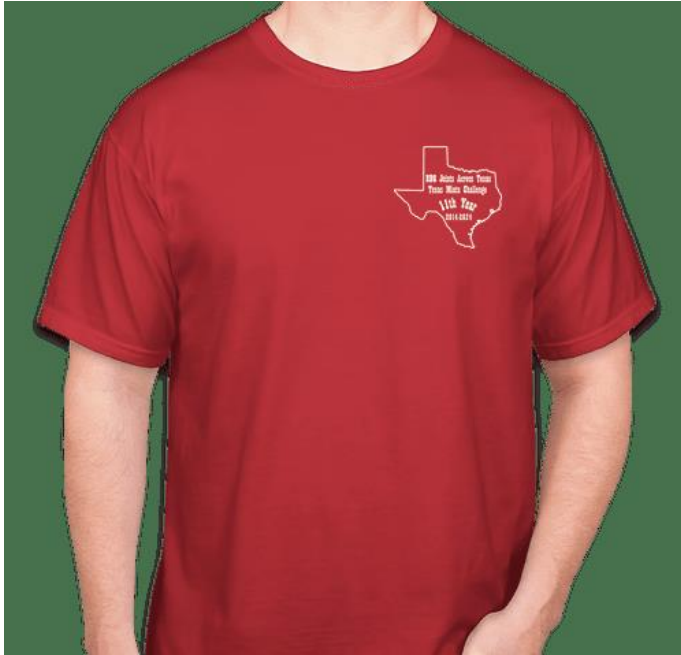
LEFT: Short sleeve T-Shirt in red. See the web site for other colors and styles.

T-Shirts can be ordered online by anyone who wants a shirt. T-Shirts include crew or V-necks, long or short sleeves in 3 colors including black, red, and gray. A hoody in light gray is also available. This year the order and pay will be online through Custom Ink, our vendor. Ordering starts September 1, 2024; ending October 15, 2024. Shirts should be delivered directly to you by November 9, 2024. The crew neck shirt in red is shown below. All order information is available at: https://www.customink.com/go/LSMCCChallenge2024