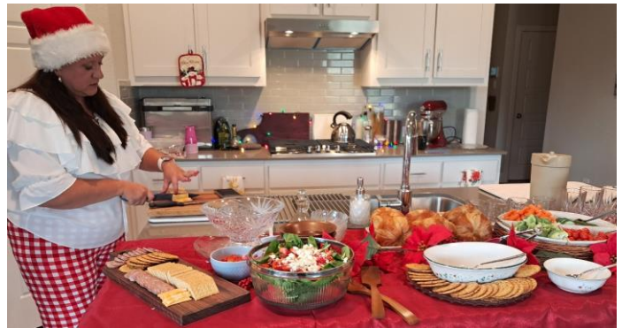
Sarah prepared an amazing lunch for everyone.