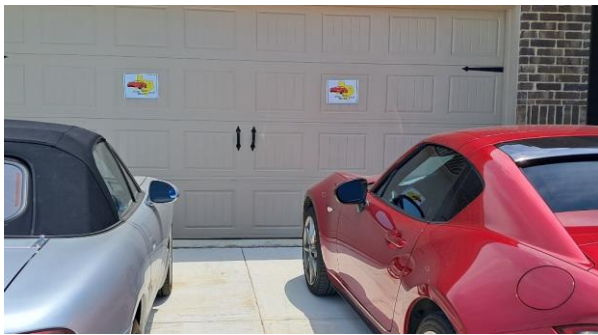
Party goers knew they were at the right place when they saw Miata Club door magnets.