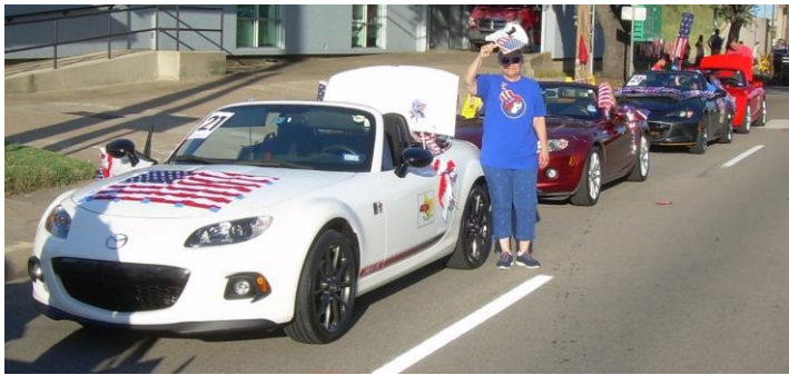
Staging for the Irving July 4th Parade. Our four Miatas being decorated.