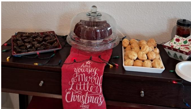
Of course there is a desert table.