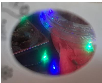
The kool glasses made points of light look like small Christmas trees.