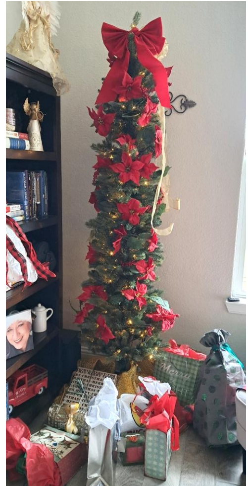
The Poinsetta Christmas tree with gifts.