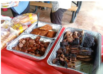
Brisket, Turkey, Sausage