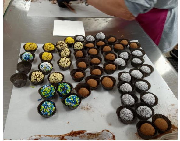
After dipping, the Truffles are placed in individual cups ready for packaging.