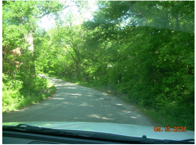
Heading north, we drove on some amazing tree lined roads.