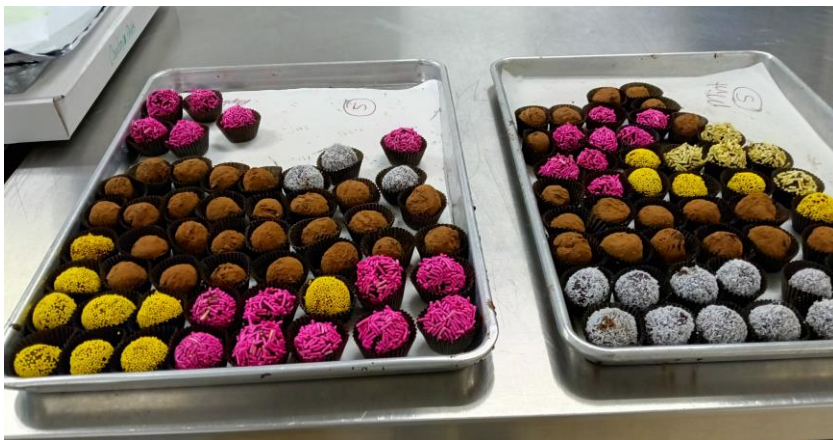
Very colorful and tasty. Each attendee got to take home over a dozen Truffles.