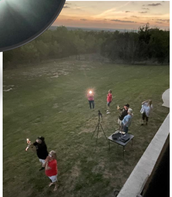
At totality, viewing glasses not needed