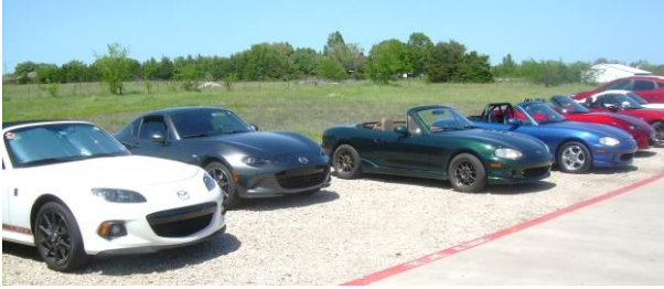
Seven Miatas at Rosini Vineyards and Winery.