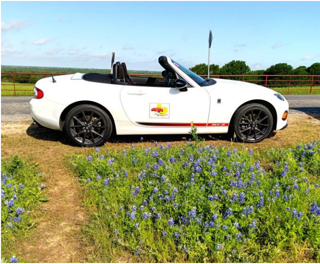
Terrie Campbell's car "Salt" with the Bluebonnets.