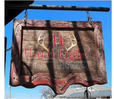
The welcoming sign at Hard Eight BBQ