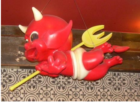
Can't have dinner at Torchy's Taco without getting a picture of Torchy Himself.