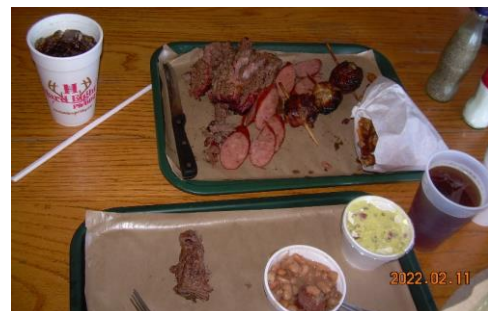
Sliced brisket, sausage, chicken poppers, beans and potato salad; what a meal!