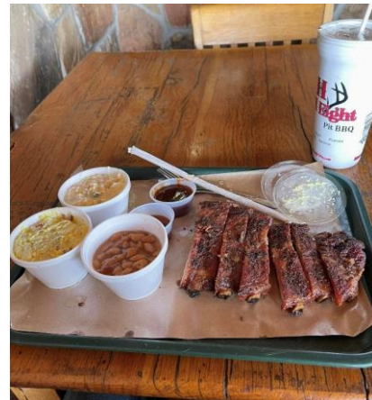
Ribs and all the beans you can eat.