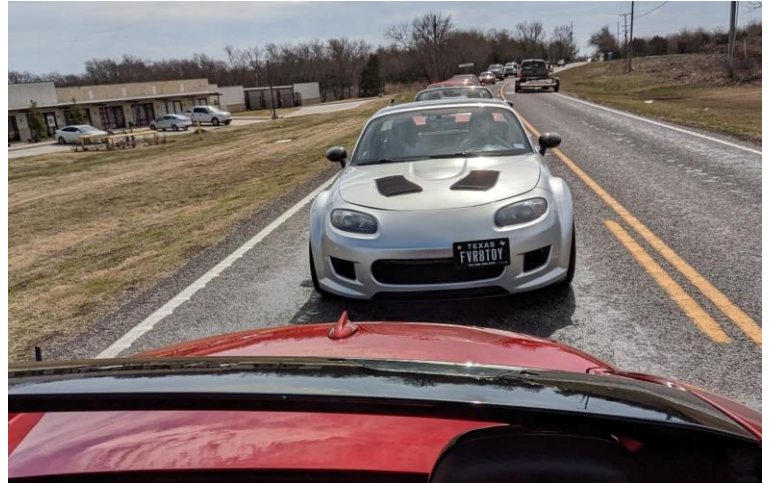
On the road with all nine Miatas.