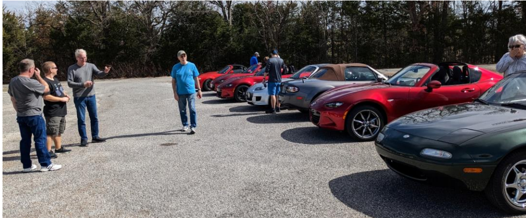
Stopping at the Eisenhower Birthplace State Historic Site in Denison