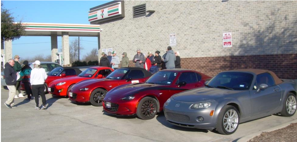
Getting ready for a drivers meeting at 7-Eleven.