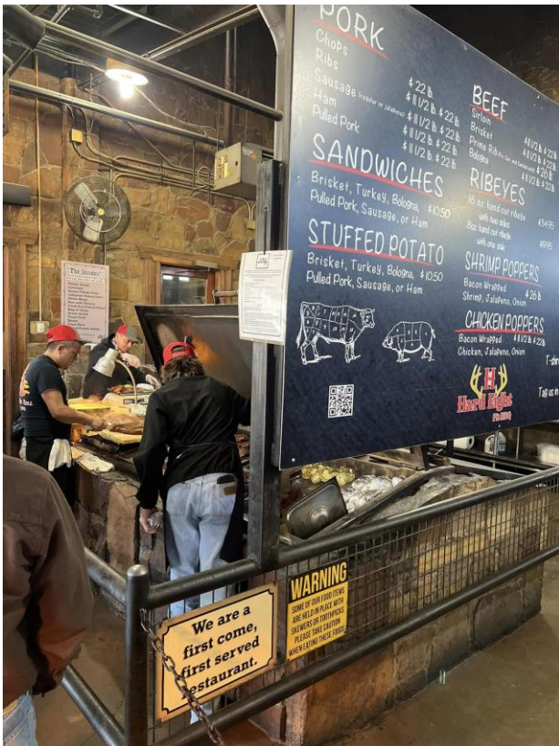
Let's cook up some good BBQ and take a look at the menu.