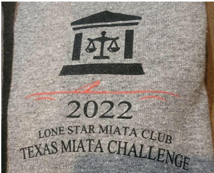
Picture of front of T-Shirt