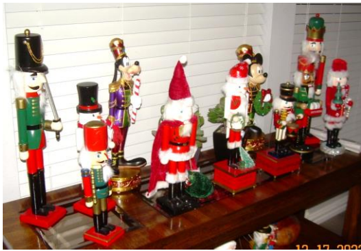
Sandy has a wonderful Nutcracker collection. These are a few of the Nutcrackers.