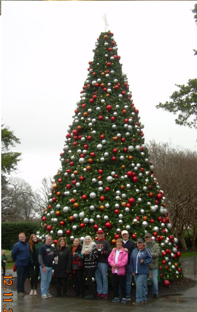
Just outside of the Christmas Village is one of the decorated Christmas Trees. The Arboretum is so festive in December. Behind the tree is the Crepe Myrtle Alley, a great picturesque spot in the early summer.