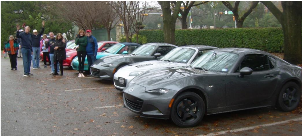
All 8 Miatas and 14 members meeting in the Arboretum parking lot