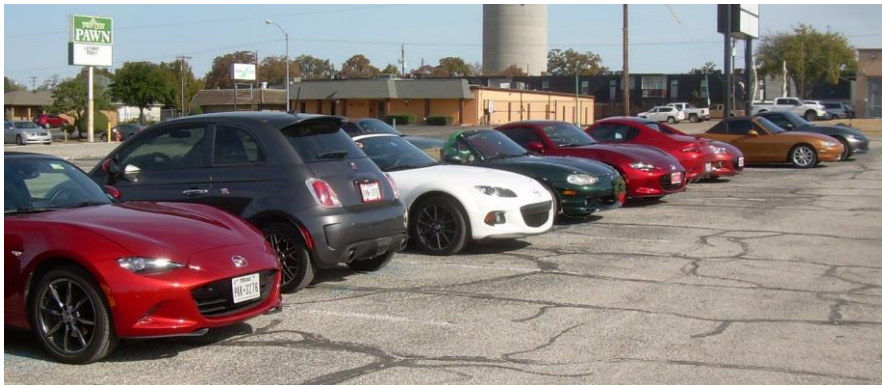
Miata's at the Turning Point Brewery in Bedford