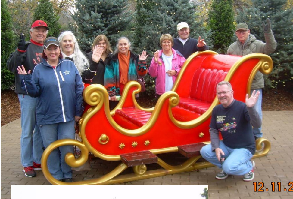
In the Christmas Village at Santa's Sleigh.