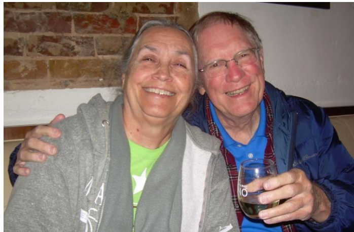
Terrie and Myself at 4 R Ranch Winery in McKinney