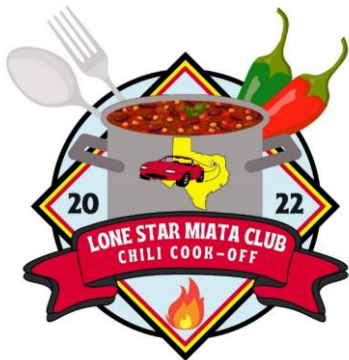
Our logo for 2022