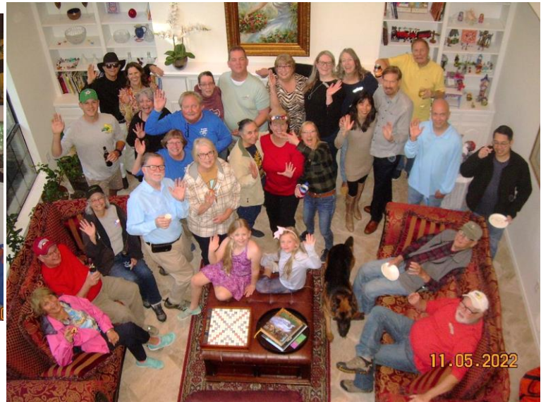
All 26 (plus myself taking the picture) LSMC members, along with Amy's daughters in the living room for a group picture