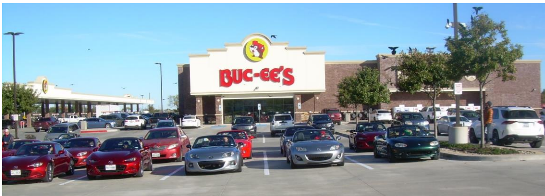
Getting ready to head out from Buc-ee's