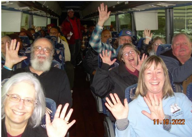
Leaving on the wine tour bus for the first winery. A full bus of Texas Winos with 13 LSMC Members