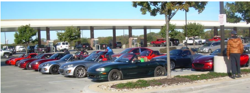
All 16 Miatas