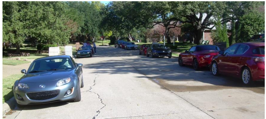
Miatas on the street in front of Amy's house