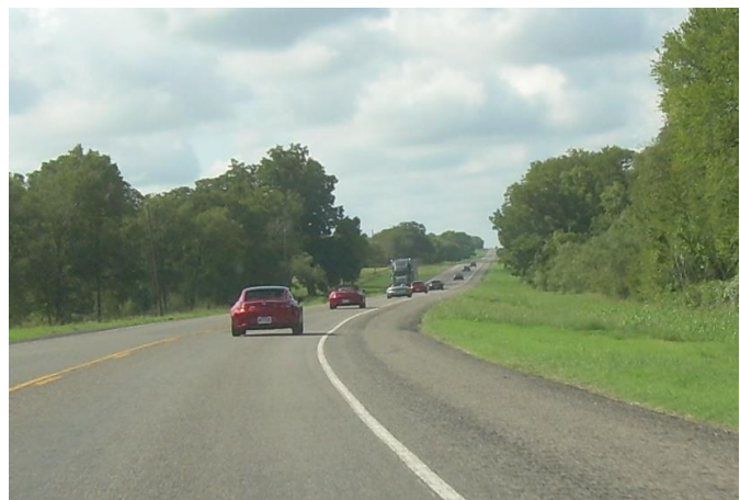
Miatas on Rte 77 heading South