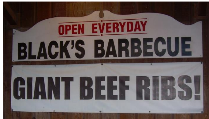
The sign at the entrance to Black's Barbecue in Lockhart TX