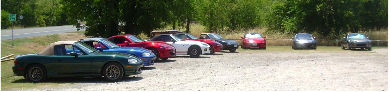
We made it to Duncan BBQ