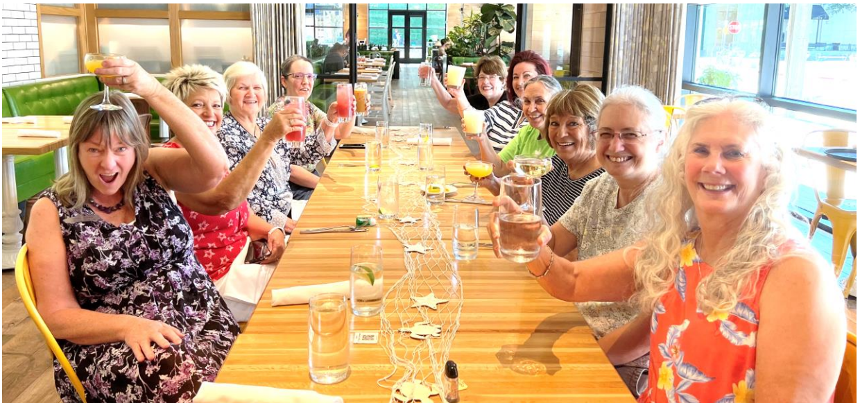
This calls for a toast. Raise your glasses to the Lone Star Miata Club Ladies.