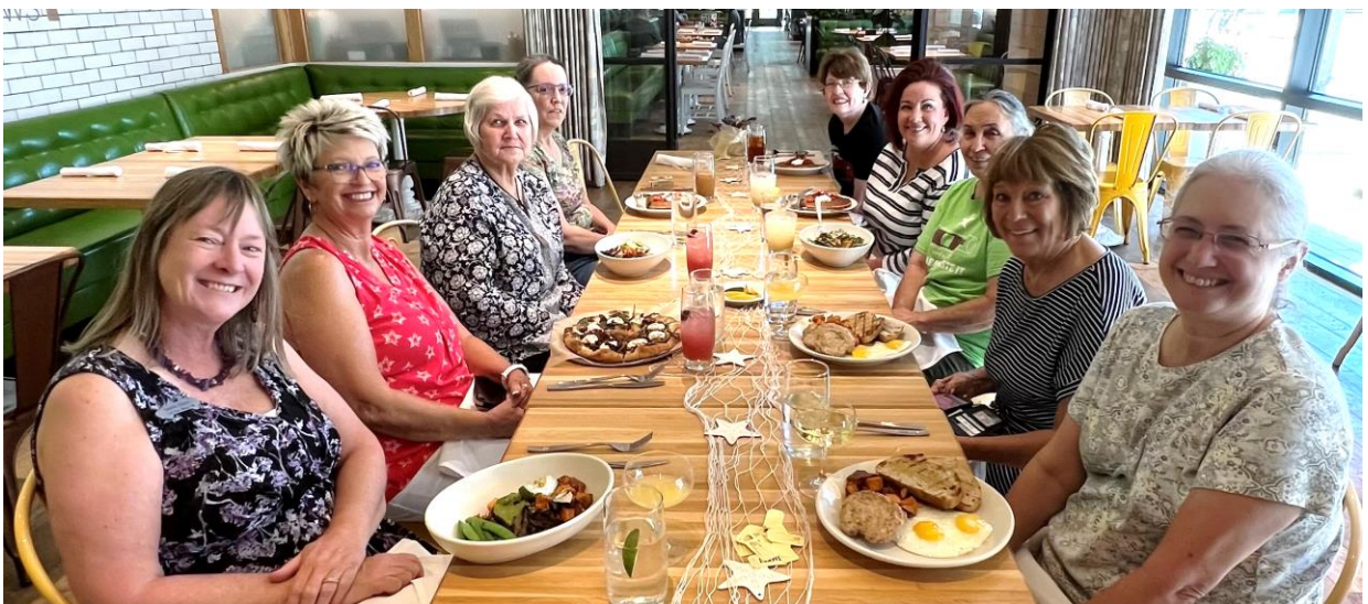
Let's dig in at True Food Kitchen in Plano