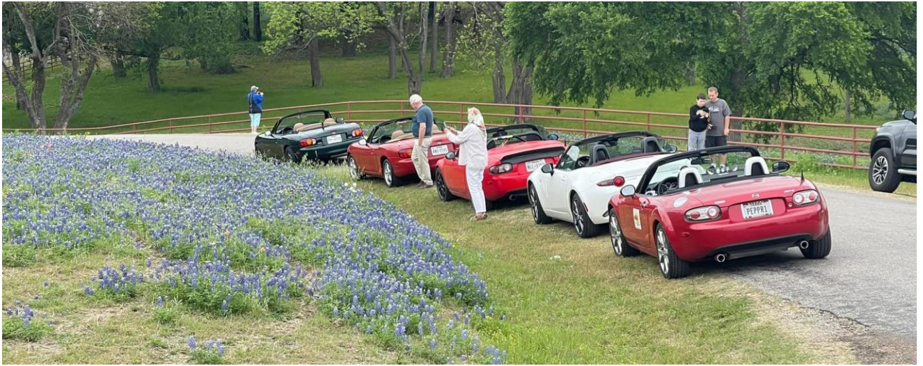
Bluebonnets were still in bloom for our Miatas doing the Bluebonnet Re-Run

Bluebonnets were still out and about in the Ennis area on our run today (4/24), but looks like the peak was last week. There was a larger variety of other wildflowers sprinkled in on our journey compared to the run on 4/9. Still a great run and ride on a mostly overcast day, and there were only 2 bicyclists on the entire 107 mile trip to pass.