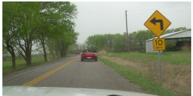
Now that's a real Miata curve coming up.