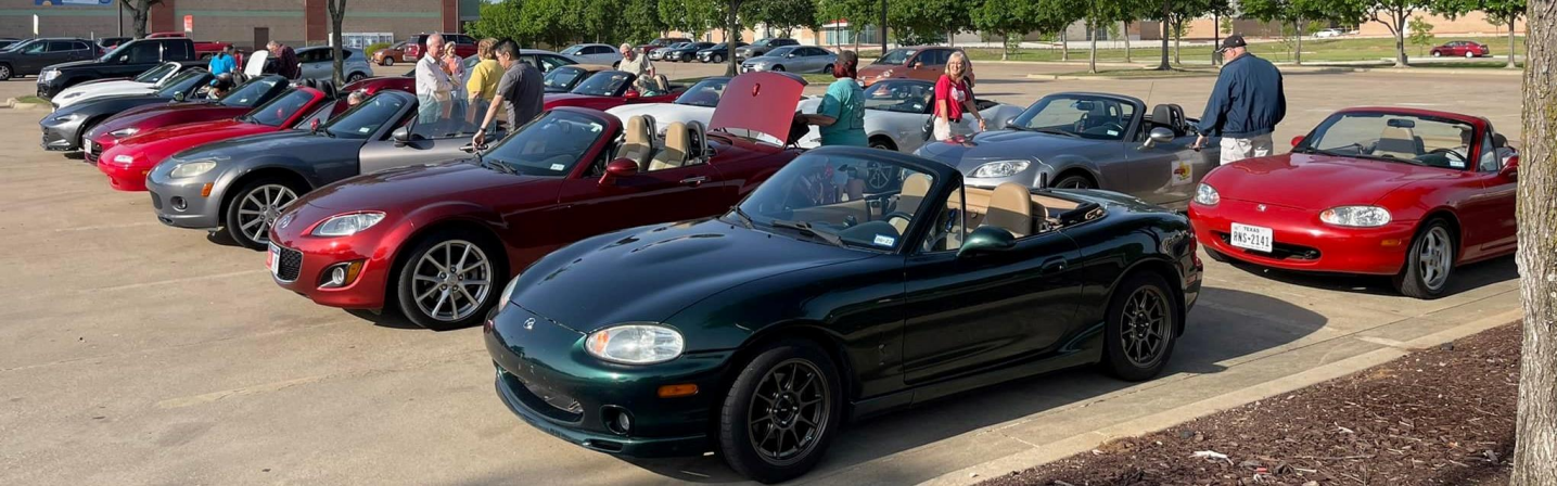
Getting ready for a great run to Loco Coyote