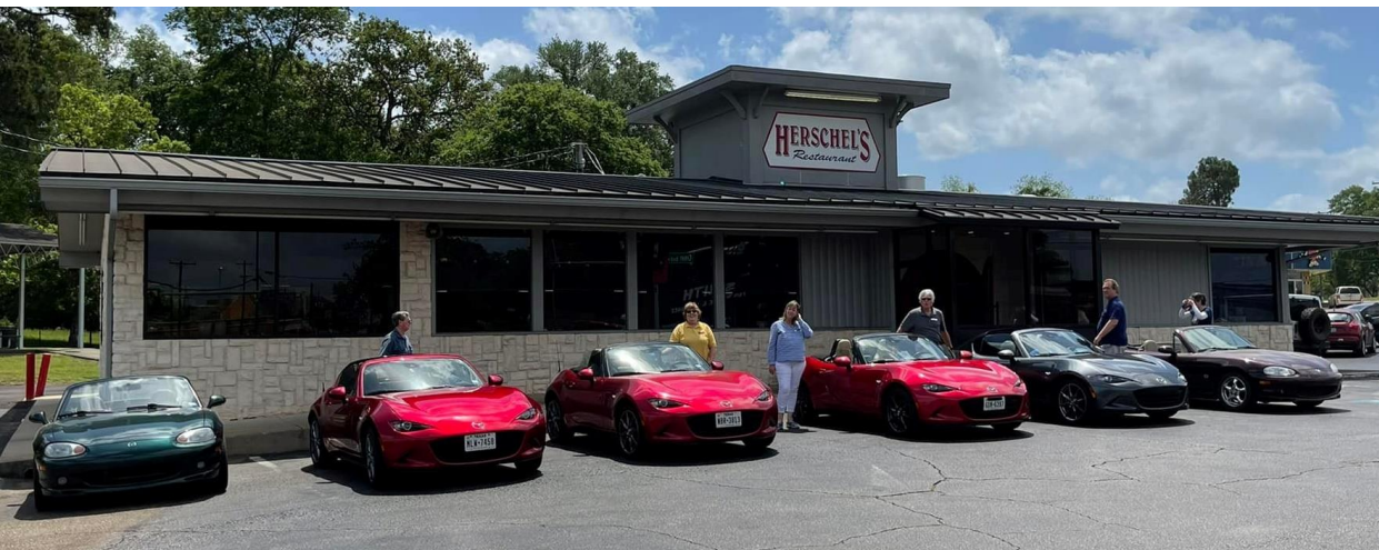
We ended with Lunch at Herschel's Restaurant