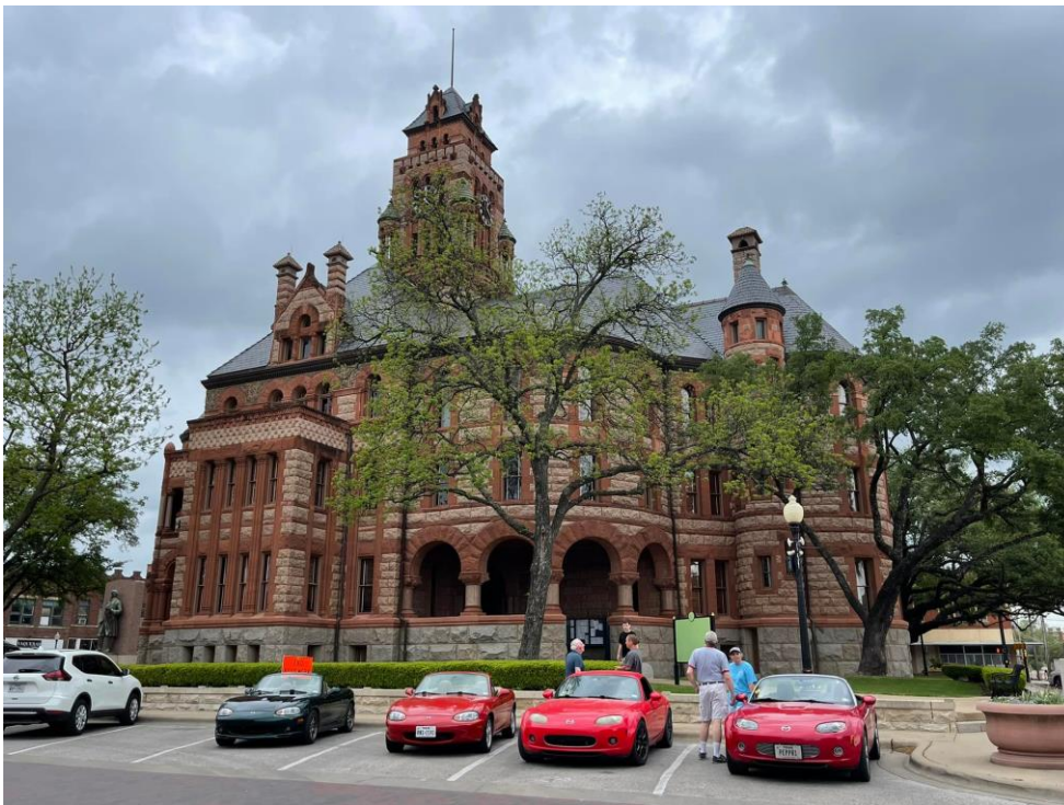
Setting up for Texas Miata Challenge photos at the Ellis County Courthouse in Waxahachie