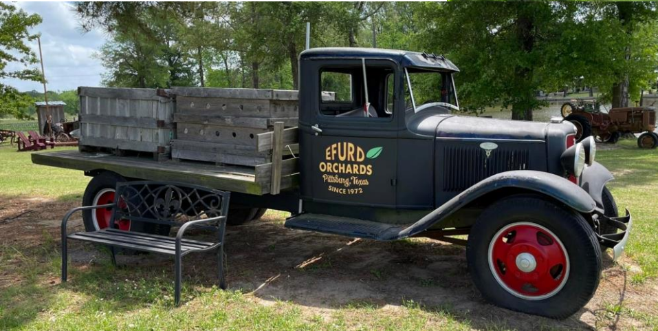
The old Efurd Delivery Truck