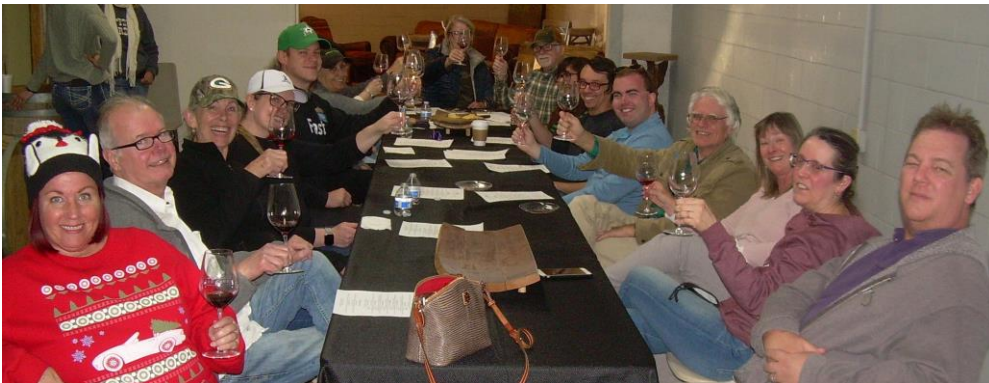
At Silver Spur Winery, a toast to another great run