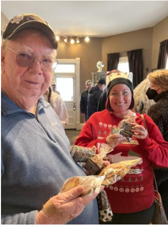
Picking out special chocolates at Wiseman House Chocolates