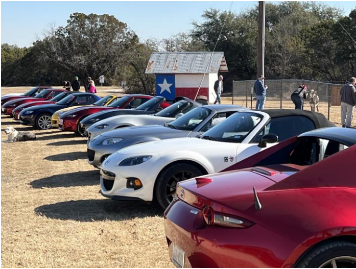
Rest stop at Sledge Distillery