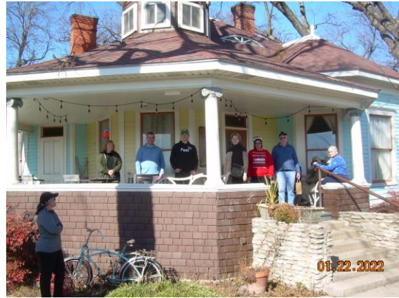
Taking it easy after some great Chocolate purchases