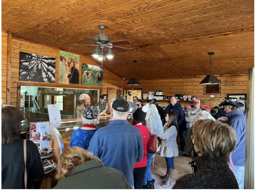
Hearing from the owner about Veldhuizen Cheese