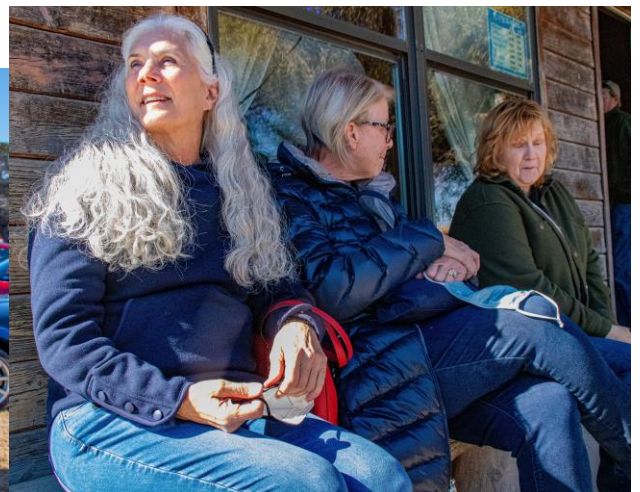
Relaxing at Veldhuizen Cheese Shop