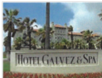
Hotel Glavez & Spa, 2024 Seawall Blvd, Galveston, TX 77550.