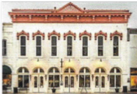
Granbury Opera House, 133 E Pearl Street, Granbury, TX 76048, picture of the Opera House.